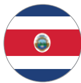
Minister Meza, Ministry of Environment and Energy, Costa Rica