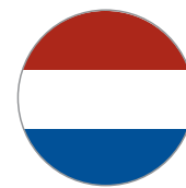
Minister Kaag, Ministry of Foreign Trade and Development Cooperation, Netherlands