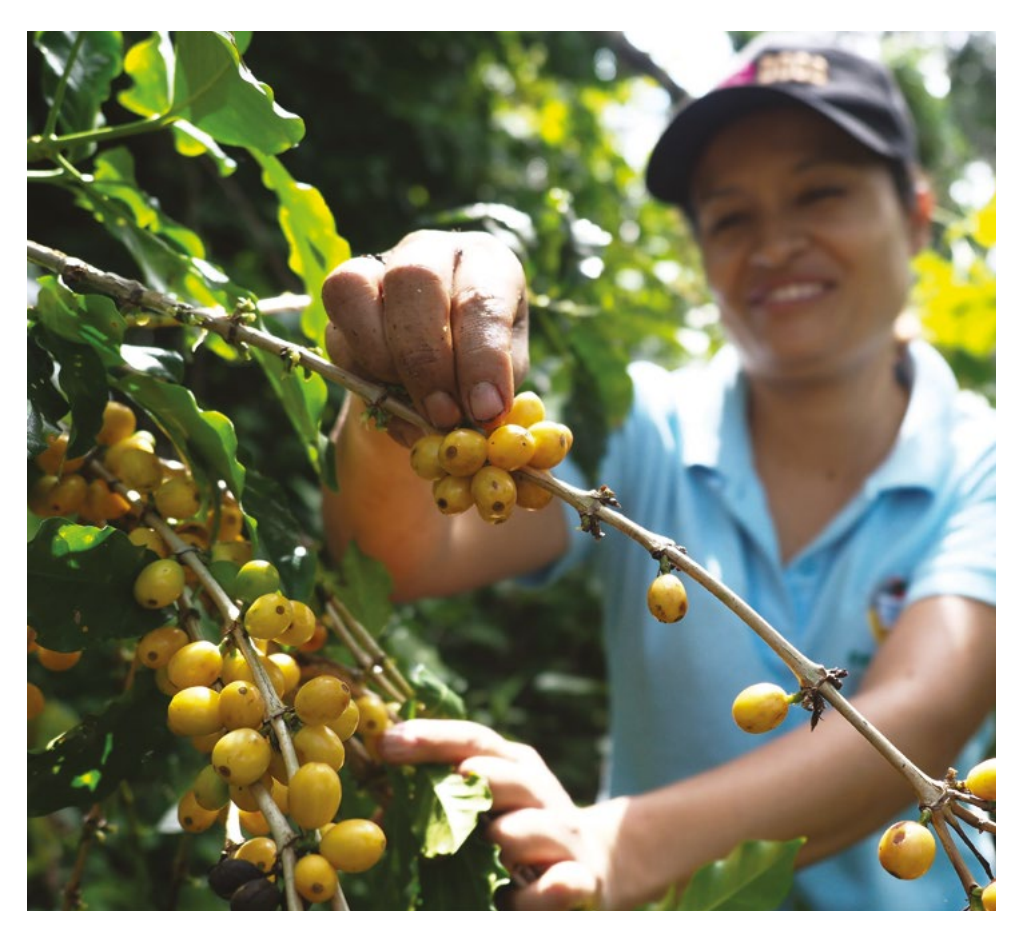
HONDURAS: A woman picks coffee beans in San Marcos, Honduras. The Government is supporting farmers in capacity building and agricultural techniques to improve crop yields, and ultimately their livelihoods, in a changing climate.