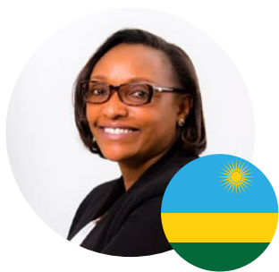
Dr. Valentine Uwamariya

Minister of Environment of the Republic of Rwanda