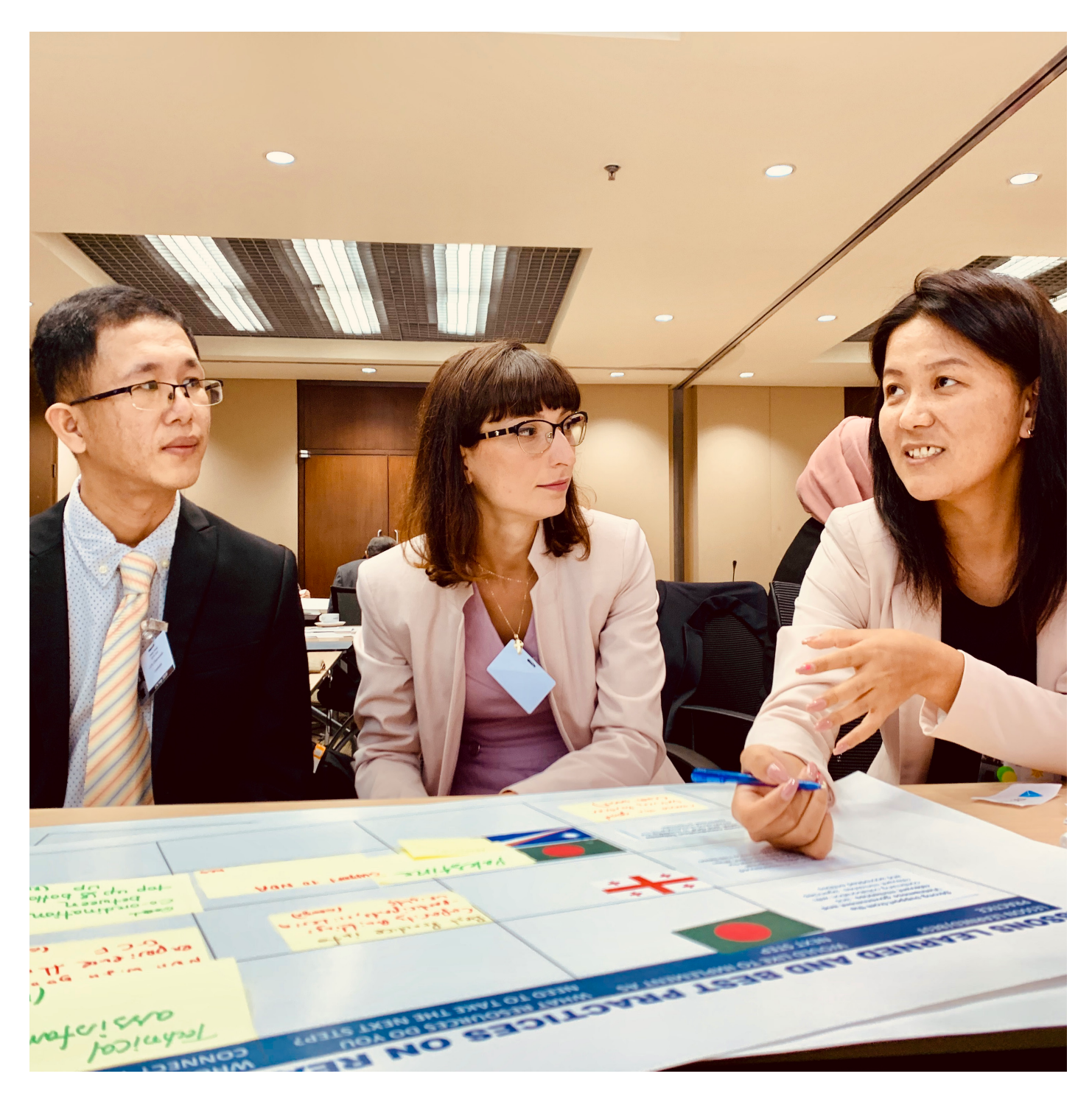
ASIA PACIFIC CLIMATE WEEK PEER-TO-PEER EXCHANGE