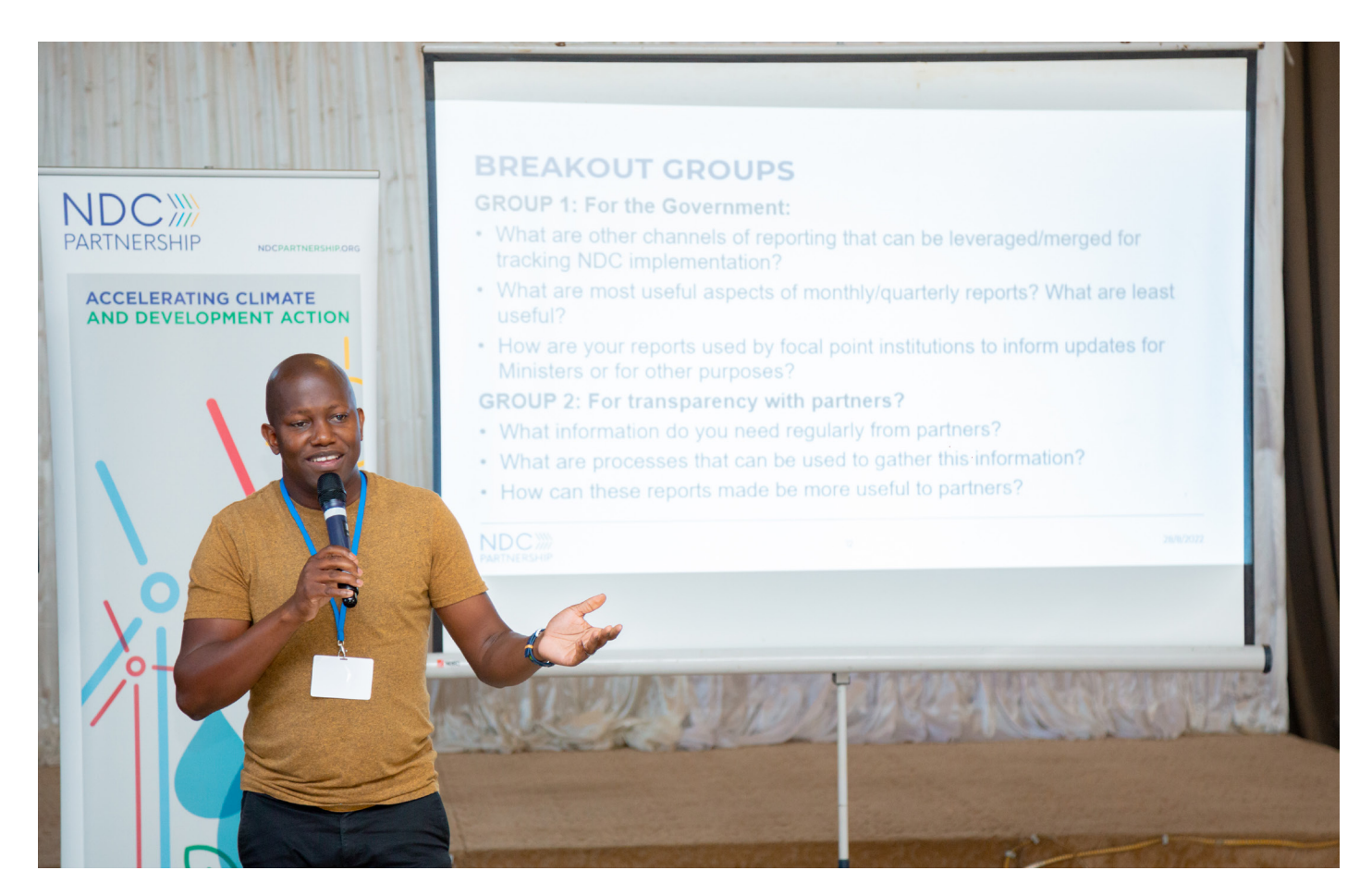
AFRICA CLIMATE WEEK 2022

Institutional and Associate Members also deliver substantial knowledge and analytical support to countries outside of the official mechanism of Partnership requests, including by participating in in-country stakeholder engagement activities, coordination mechanisms or other support as defined by individual work programs.