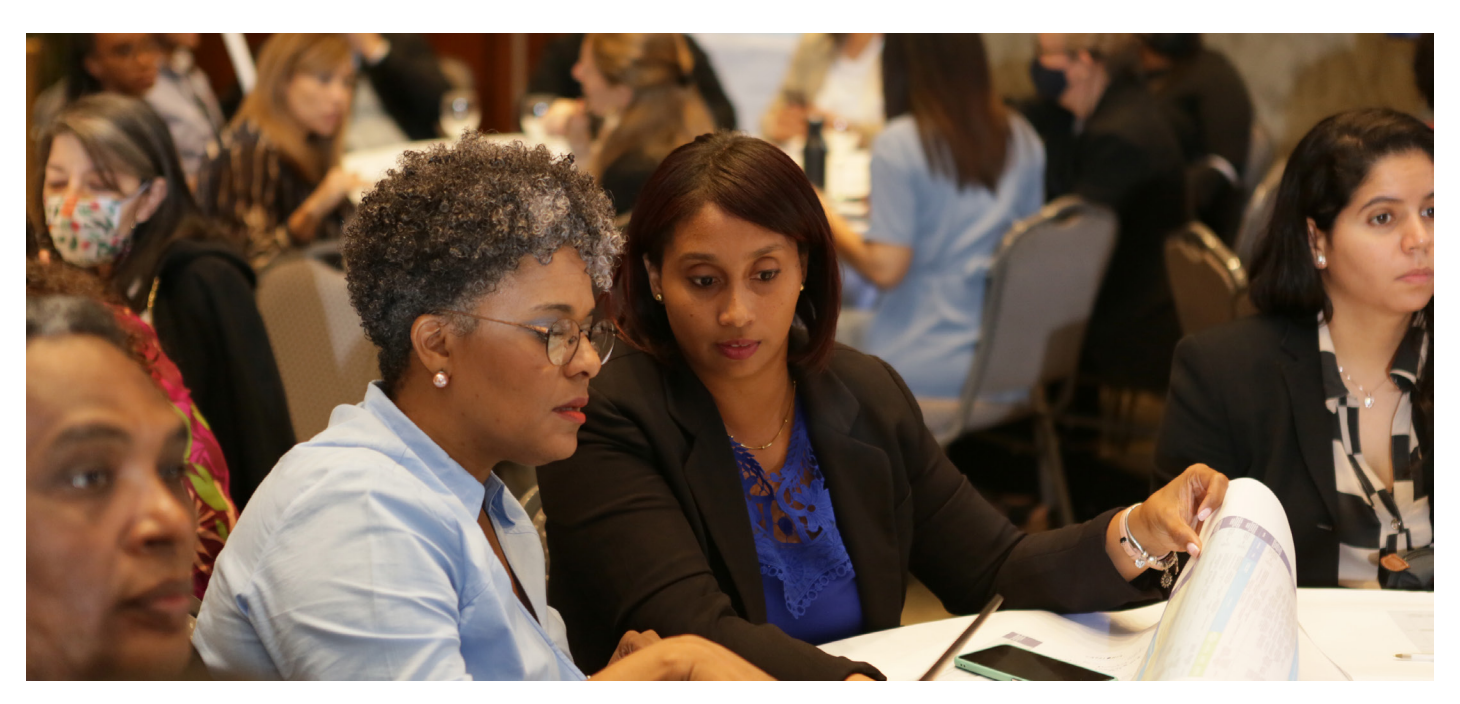
DOMINICAN REPUBLIC PARTNERSHIP PLAN VALIDATION WORKSHOP

The NDC Partnership's knowledge and learning activities, outlined below, exist within the context of the Partnership's in-country engagement. The Country Engagement Process ( Figure 4 ) illustrates the NDC Partnership's process to support countries in the development and coordination of their NDC implementation plans. This process is illustrative, as countries can determine which stages—and therefore which knowledge and learning outputs and activities—are most relevant to pursue and when. Figure 5 illustrates when and how various knowledge and learning activities typically align with the five stages of the Country Engagement cycle. Each of the activity categories is further described in the remainder of this strategy.