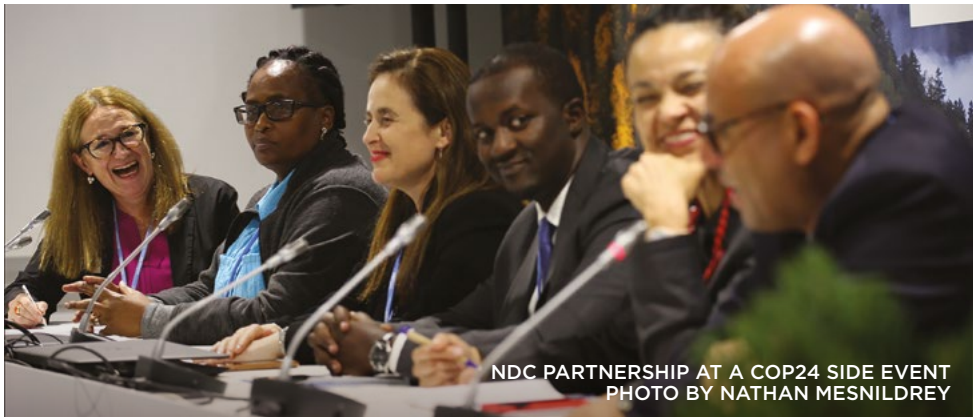
NDC PARTNERSHIP AT A COP24 SIDE EVENT

Learn more about the NDC Partnership’s members at: ndcpartnership.org/members