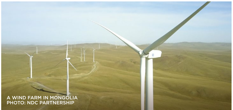
A WIND FARM IN MONGOLIA

These countries are developing NDC Partnership Plans to identify climate priorities and match them to partner resources to accelerate NDC implementation. Learn more at: ndcpartnership.org/how-we-work