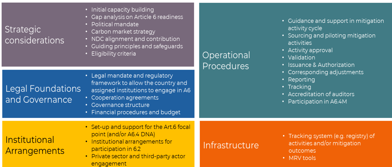
Figure 2: Sub-elements associated with each building block

The building blocks presented do not indicate the priority level of the Article 6 readiness building blocks, nor how a given country should approach them. Likewise, while all building blocks are inherently linked, some are more directly related to each other. In applying the framework, it is important to consider the interlinkages across building blocks. For instance, defining operational procedures (e.g., how activities under Article 6 would need to be approved in the country) will likely impact the needed institutional arrangements, as certain institutions would need to be involved in the operation of the procedure (e.g., assessing and approving the activities).